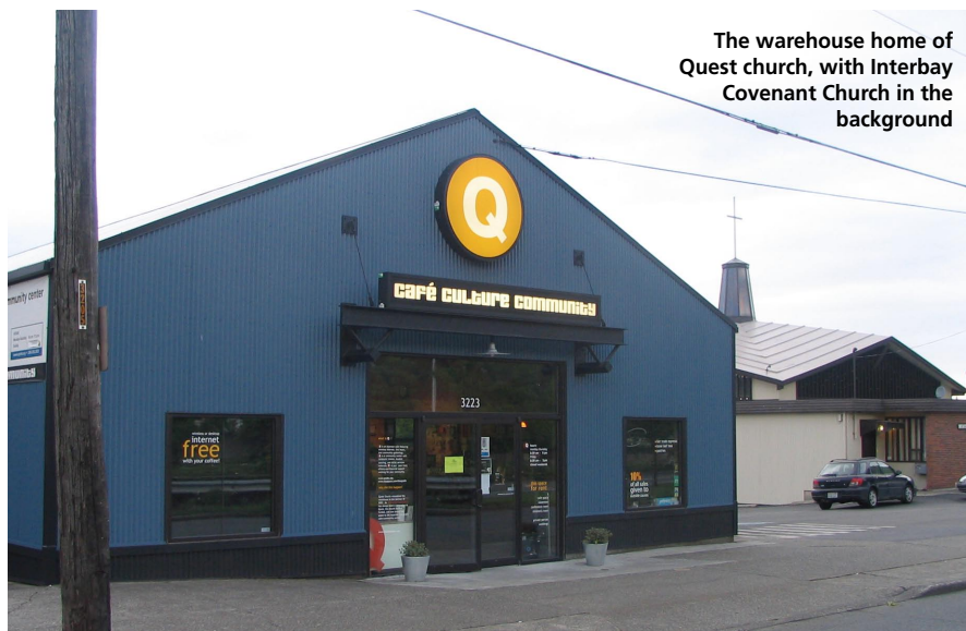
The warehouse home of Quest church, with Interbay Covenant Church in the background

Still, change is not easy. Worship services will be held in Interbay's sanc-