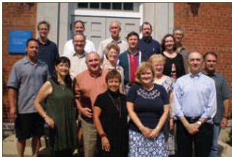
Above: Center for Spiritual Direction Graduates, Summer 2008

“At the advice of mentors, I sought out a spiritual director, and through this unique ministry I began to regain the intimacy of my relationship with Christ and the fire of my calling was re-ignited. ... Because of spiritual directions’ profound effect on my walk with Christ, I wanted to expose my congregation to this unique ministry experience. I was accepted in the Center for Spiritual Direction ... and for the past three years have watched my church’s and my relationship with Christ grow even deeper.”