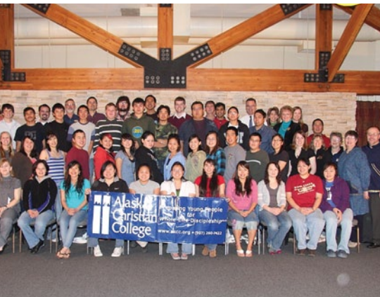
ACC provides access to higher education for students from Bush villages in Alaska.

Jesus implores us to provide for the hungry, the thirsty, the naked, the sick, the stranger, and the imprisoned, but caring even beyond offering a cup of cold water or providing the naked clothing. Our acts of compassion and mercy continue with advocating for justice until we have achieved God's shalom by making things right. CR