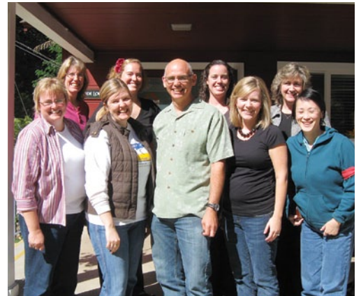
Women Leadership Cohort retreat, Fall 2009.