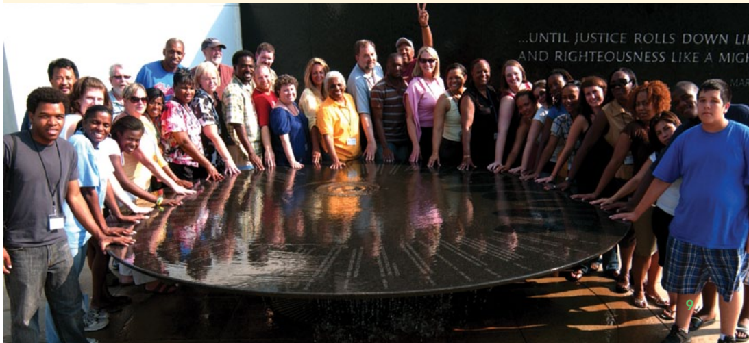
The Sankofa journey exposes cross-racial partners to the civil rights movement.

New Hope Counseling Center, which is located on the campus, provides free counseling to students who desire it. The center moved into a new 3,200 square-foot building last fall, doubling the number of offices they previously occupied on campus. Financial donations and volunteer labor made it possible to construct the facility without any cost to ACC. CR