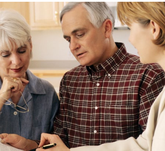
Covenant Trust Company client accounts overall experienced less than half the decline in value of the overall market.

The system makes life a lot easier as the churches don't have to send the physical investment certificates back to NCP for partial redemption or to add more money. We have been pleasantly surprised by the strong desire of churches to use these accounts. We think the simplicity of the account and the rate of return to the church have made it very attractive compared to the paltry interest being paid by banks currently. CR