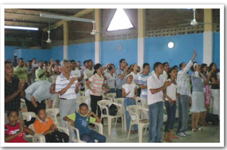
Combined service of the Barranquilla churches

While we lived in Bogotá, we often sought out the Covenant pastoral couples and initiated some gatherings and ministry among them. One major reason for our move to Medellín eight years ago was to carry on this spiritual mentoring and pastoral ministry