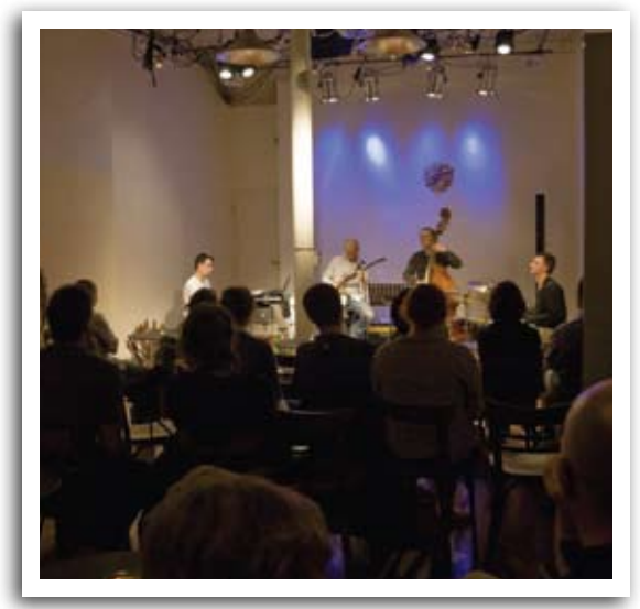
Small ensemble concert at La Fonderie

of the first gathering, people prayed that at least a handful of artists would come. God answered those prayers when more than fifty showed up. A small team began to organize various gatherings and events.