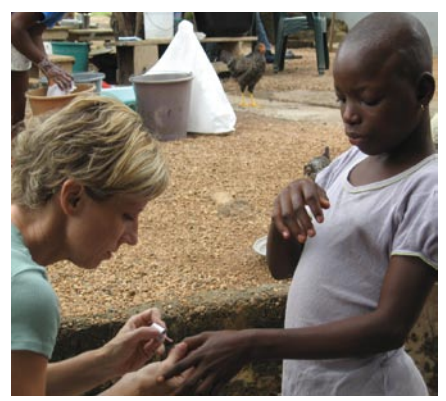
A participant in Genesis Covenant Church's outreach to Ghana makes friends with a young girl.

Beloved church activities: Eating food together and camping together