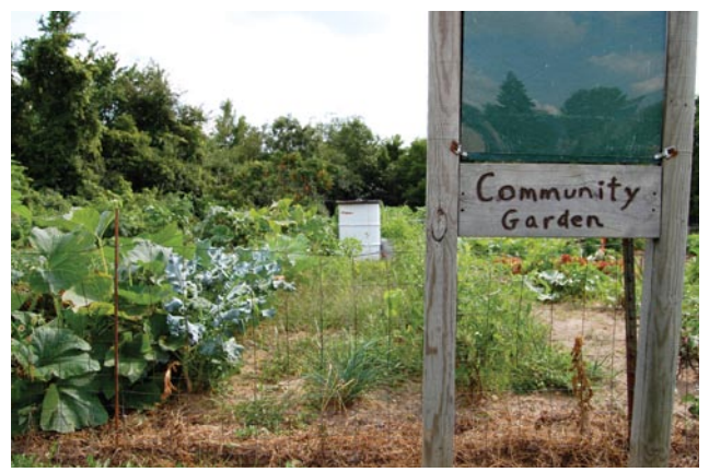
Arbor Covenant's community garden not only provides nutritious food, it brings people together.

Despite its small size, the church is a hub of continuous activity. Generous stewards of their facility, Arbor shares their building with a community daycare on weekdays, and with an African American fellowship—Vessels of Praise Apostolic Church—on Sundays. Even the church's yard is put to use as a community garden. About a third of the plots are used by church members, Jim explained, and the rest