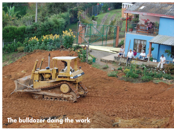
The bulldozer doing the work