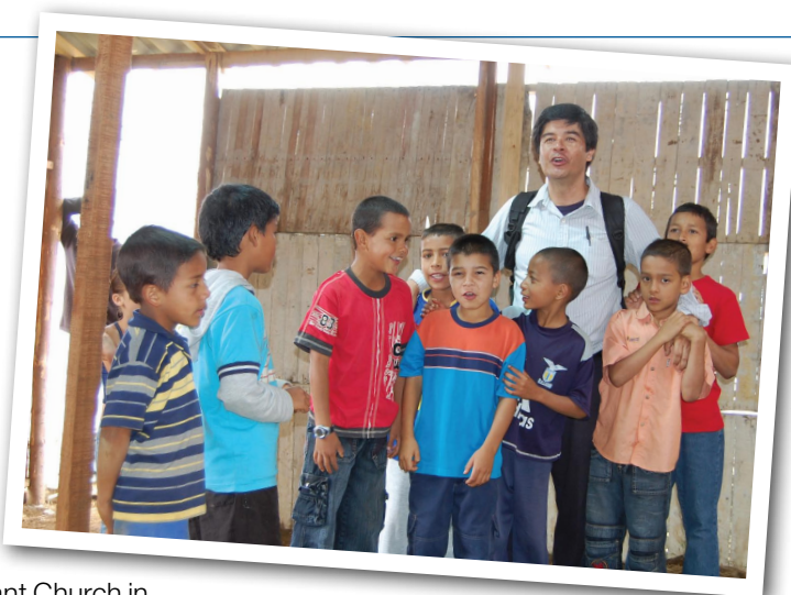
A group of boys who live at the Peace House

hand was as much as they could hope to do. Getting the first fifty-four feet of pipe into the ground in about four hours was an accomplishment for the team. Everyone felt that God had answered their prayers after a good first day. No one shared what they had been silently praying as they worked.