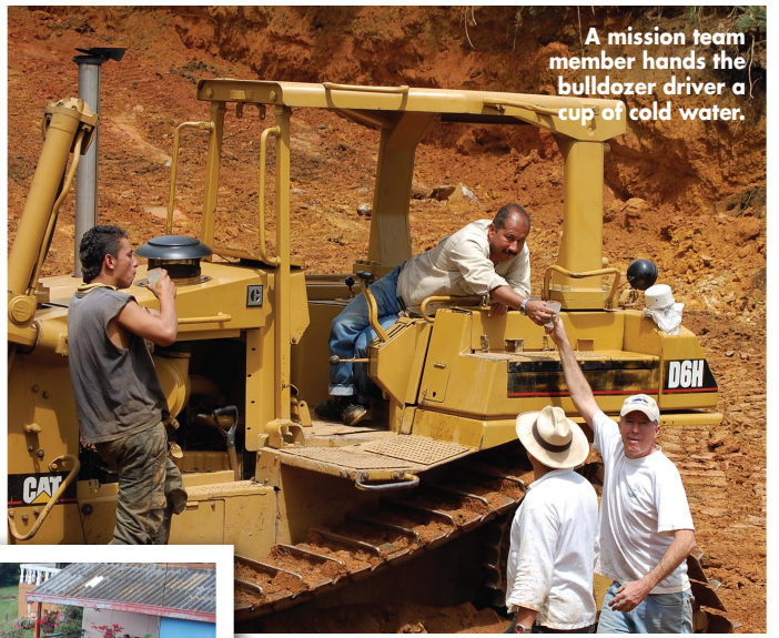
A mission team member hands the bulldozer driver a cup of cold water.