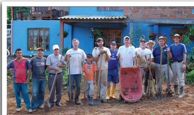
The group that worked on the soccer field, including members of First Covenant Church in Sacramento, California

The water runoff from the mountain behind them had formed deep trenches in the yard. Trying to control that by