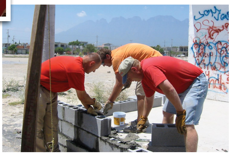
Mission team members begin construction on the wall.