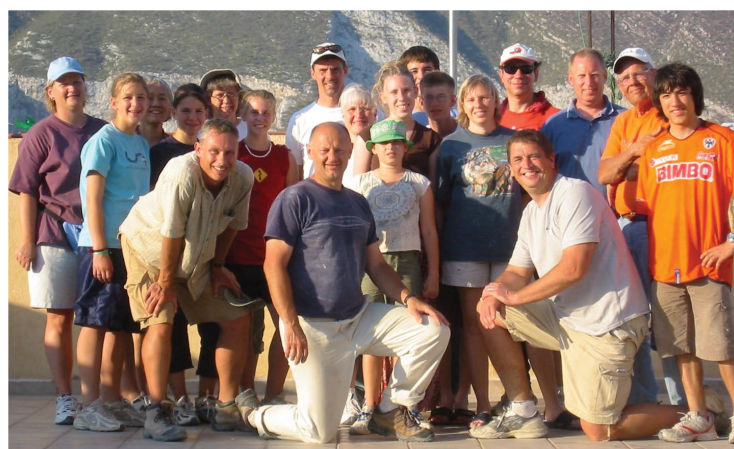
Members from Hillcrest Covenant Church in DeKalb, Illinois and Elim Covenant Church in Moline, Illinois, gather for a group photograph after their work at Roca de Salvacion Church in Monterrey, Mexico.