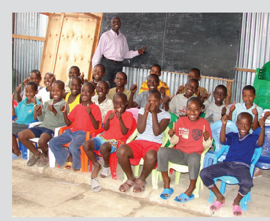
Congolese refugees go back to school in Kenya.

This year's Children's Service Project will provide real hope for children living in Kenya. This project benefits war refugees from Congo who have been forced to flee to Kenya. Through this project, children will be able to return to school and have a new start on their life in Kenya. The Children's Service Project provides the children in your church the opportunities to serve God and others, develop a larger view of God's Kingdom, connect with children from around the world through their stories and to help meet some of the basic needs of children living in poverty. The materials for this project will be sent to each church in July. As you think of going back to school, please consider helping these vulnerable children go back to school as well.