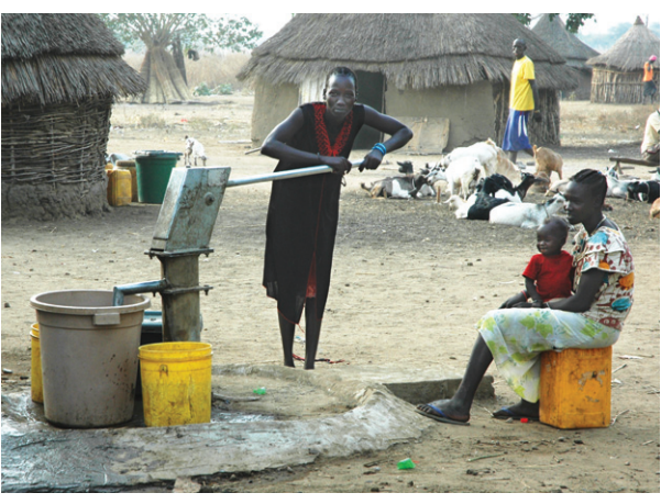
The Covenant Pump at work in Sudan.

the pumps all over the world. Today it is the largest selling hand pump in the world and there are now several million Mark 2 and Mark 3 pumps in operation. Hundreds of millions of people have access to clean water because of the Hindustani Covenant Church and the Covenant Pump.