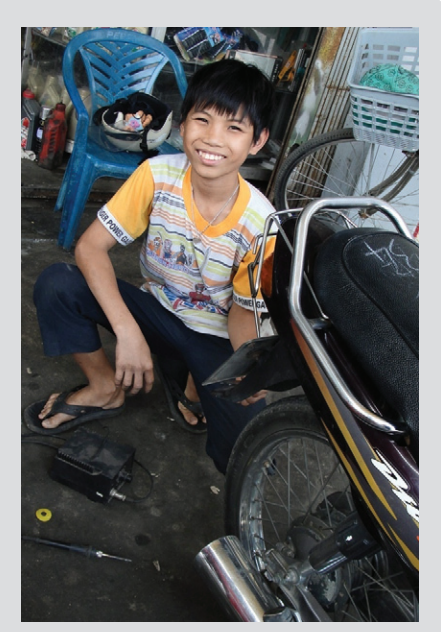
Job training provides hope for a new future in Vietnam.