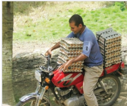
In Colombia, a small community-run poultry business is bringing change.

A major component of transformational community development is empowerment. People and communities are empowered to address the systemic issues that keep them poor, powerless, and marginalized. Transformational community development is never a quick fix. It requires a long-term commitment to work together with our partners and with the people they serve. This is what Covenant World Relief is all about.