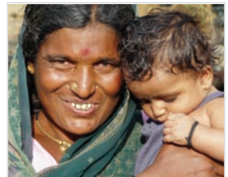
A woman and child in India benefit from holistic community development in partnership with the Hindustani Covenant Church.

Did you know you can receive these CWR updates by email four times each year? By receiving the updates electronically you are able to stay connected to the work of CWR and help cut down on postage and printing costs. To subscribe, just email us with the subject line "CWR updates electronically."