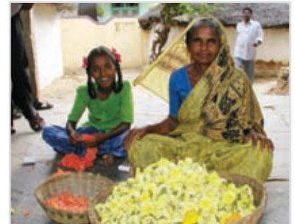
Through a small loan, a woman is able to begin a business selling flower ornaments.

This is the fourth year of the CWR project in Dang in partnership with the Hindustani Covenant Church. The work of HCC is always comprehensive and this project includes day care for pre-school aged children, education, micro-finance, vocational training, medical care, and self-help groups. Each member of the group has their own personal savings book and each saves between 40-60 cents per month. When asked about how their lives have been affected by participation in the self-help groups, one woman responded, "Before I had no say in family matters, but now my husband respects me more and I participate with him in decision making." Because of the group savings, the women are able take out small loans at low interest. Some have received loans for micro-businesses like flower ornament making, vegetable sales, and basket making.