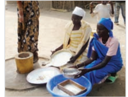
Women from the Covenant Church of Sudan are able to provide food for their families because of emergency relief.

In partnership with CWR, the ECCS is also focusing its attention on the most vulnerable children in these communities. The ECCS is carrying out a community development project that addresses the immediate needs of the identified children and their families (if they have parents) and through basic education and vocational training they are seeking to empower and equip the children and their families to rise out of abject poverty. —DAVE HUSBY