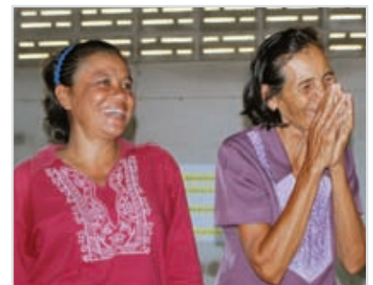
Though they are marginalized, these women find community and are empowered through a CWR project.