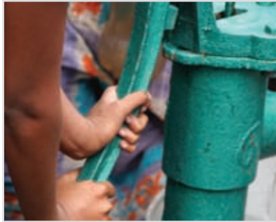
A rural community now has access to water and has clean water for washing and bathing, small gardens and caring for their farm animals.

It is clear that God is at work improving the lives of the people in this village in East Asia, and though there are many communities that are still in need of access to water, it is encouraging to know that one more community is able to experience the Good News of the Kingdom through something as basic as water.