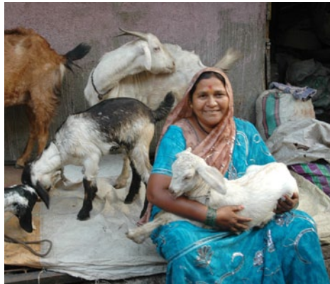
Small business loans made possible by your contributions are empowering Indian women to change their lives.