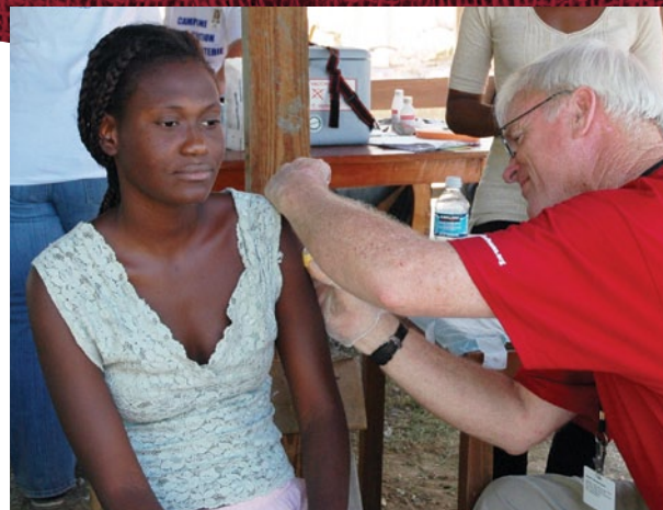
Covenant World Relief partner Medical Teams International has immunized thousands of earthquake victims in Haiti.

During a recent trip to Haiti, we saw the devastation of the earthquake first-hand. Many of the World Relief workers lost family members and their homes, but they continue to serve thousands of other survivors. The collaboration of the Haitian government, the UN, and the major relief