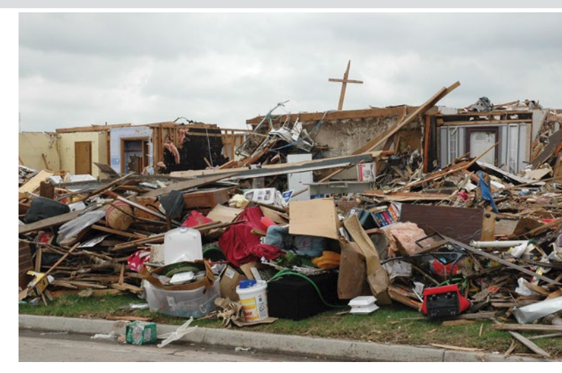
Devastation after Moore, OK tornado.

reduction project among the poor in Pakistan. It is said that for every dollar spent reducing vulnerability, five dollars are saved in disaster relief costs. The majority of the funds donated to Covenant World Relief are used to address extreme poverty and injustice—through micro-enterprise development, agricultural development, community health, women's empowerment, education, vocational training, and provision of clean water.