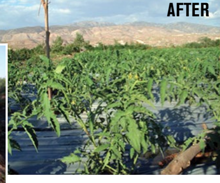
After CWR project: Healthy tomato plants