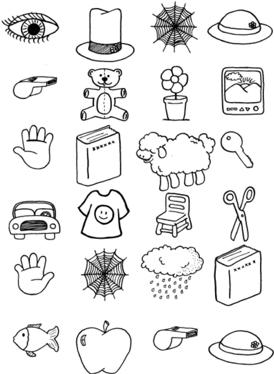
Illustration Who did it?