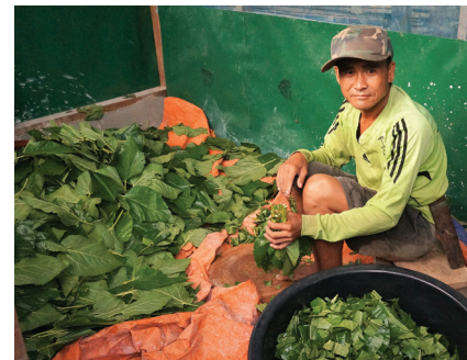
Mulberry leaves produce tea and also are food for the silk worms.

Mulberries plans to add 300 new silk farmers and 100 new weavers by 2022. But the impact of Mulberries goes beyond economic empowerment for the community. Local staff are also given the opportunity to share their faith in a nation where many people have never heard the gospel.