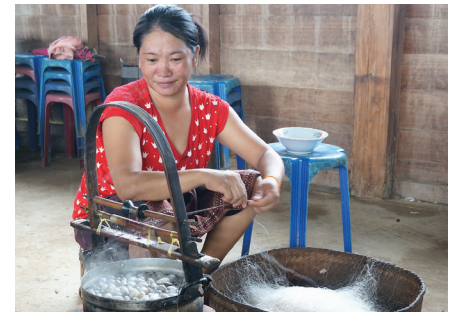
Spinning silk is a special skill taught at Mulberries.

Laos, officially the Lao People's Democratic Republic (Lao PDR), is a creative access nation and Thathom District in Xaisomboun Province has no known Christian presence at the moment. Xieng Khouang and Hua Phan are also ethnically diverse populations with a very small Christian presence. The presence of the Christian staff is bringing the word of God to many local areas.