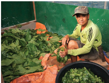
Mulberry leaves produce tea and also are food for the silk worms.

Mulberries plans to add 300 new silk farmers and 100 new weavers by 2022. But the impact of Mulberries goes beyond economic empowerment for the community. Local staff are also given the opportunity to share their faith in a nation where many people have never heard the gospel.