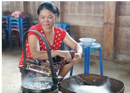
Spinning silk is a special skill taught at Mulberries.

Laos, officially the Lao People's Democratic Republic (Lao PDR), is a creative access nation and Thathom District in Xaisomboun Province has no known Christian presence at the moment. Xieng Khouang and Hua Phan are also ethnically diverse populations with a very small Christian presence. The presence of the Christian staff is bringing the word of God to many local areas.