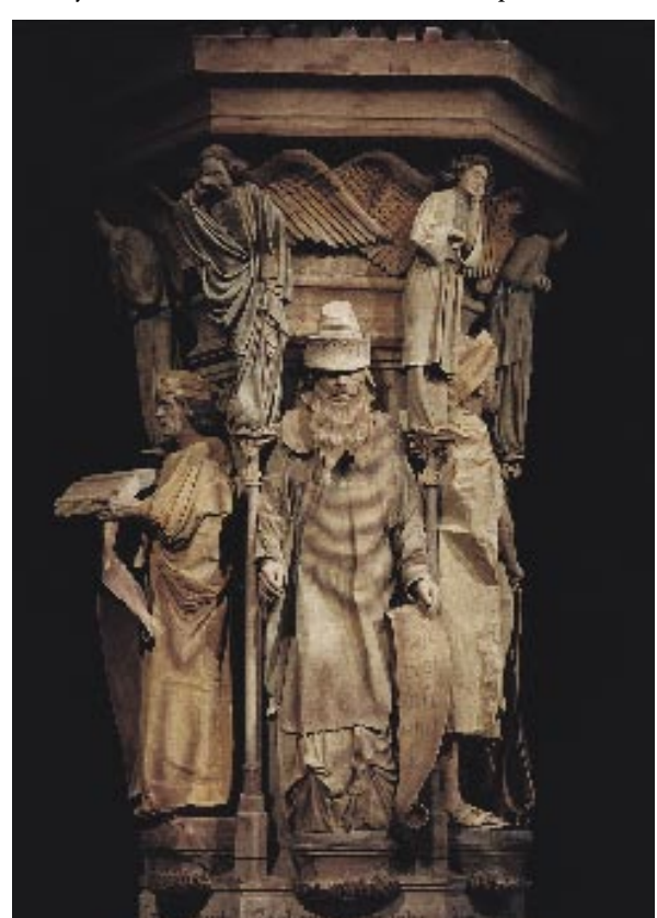
The Well of Moses is a fourteenth-century sculpture by Claus Sluter.

"I have visited art museums in many countries of the world searching for art that would fit the theme of the pageant and that would be feasible to recreate in life-size dimensions," he says. "It is difficult to find art—sculpture,