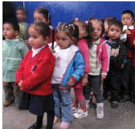
Preschool children at the Potosí School line up for recess.