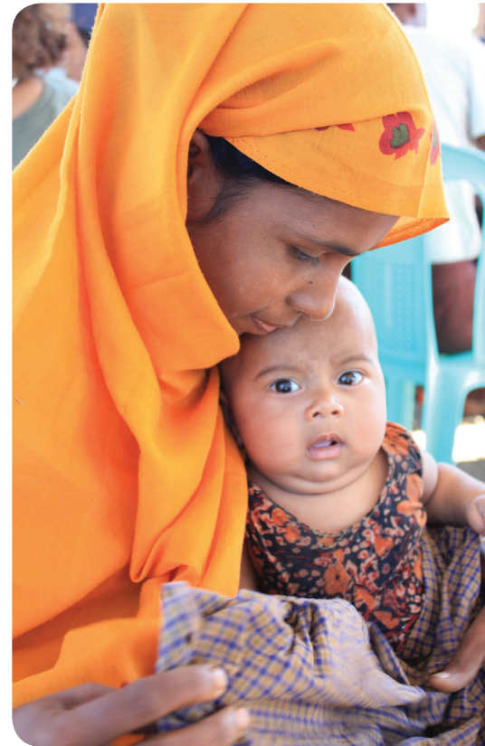
Covenant medical missionary responds in Burma.

Thanks to all who give faithfully so that CWR is able to respond immediately to disasters.