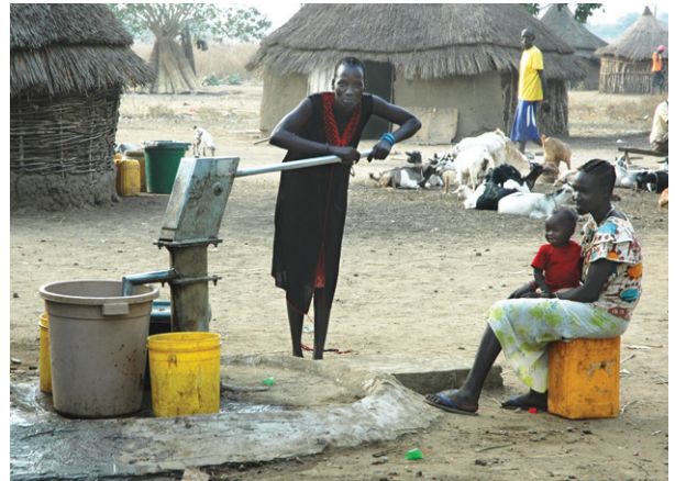
The Covenant Pump at work in Sudan.

As I travel around the world I am amazed at how often I find the "Covenant Pump" providing water to those who have had limited or no access to water in the past. In 1968 the Solapur Hand Pump was designed by a Swedish Covenant missionary and his Hindustani Covenant Church co-workers in Solapur, India. This pump was modified and became known as the Mark 2 Hand Pump. Through its