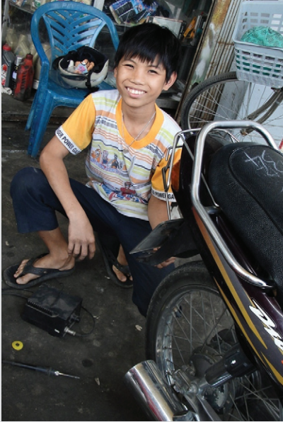
Job training provides hope for a new future in Vietnam.