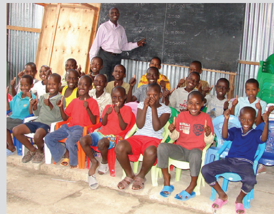
Congolese refugees go back to school in Kenya.

This year's Children's Service Project will provide real hope for children living in Kenya. This project benefits war refugees from Congo who have been forced to flee to Kenya. Through this project, children will be able to return to school and have a new start on their life in Kenya. The Children's Service Project provides the children in your church the opportunities to serve God and others, develop a larger view of God's Kingdom, connect with children from around the world through their stories and to help meet some of the basic needs of children living in poverty. The materials for this project will be sent to each church in July. As you think of going back to school, please consider helping these vulnerable children go back to school as well.