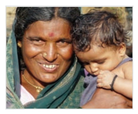
A woman and child in India benefit from holistic community development in partnership with the Hindustani Covenant Church.

Did you know you can receive these CWR updates by email four times each year? By receiving the updates electronically you are able to stay connected to the work of CWR and help cut down on postage and printing costs. To subscribe, just email us with the subject line "CWR updates electronically."