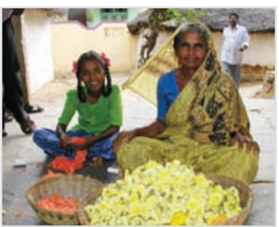
Through a small loan, a woman is able to begin a business selling flower ornaments.

This is the fourth year of the CWR project in Dang in partnership with the Hindustani Covenant Church. The work of HCC is always comprehensive and this project includes day care for preschool aged children, education, micro-finance, vocational training, medical care, and self-help groups. Each member of the group has their own personal savings book and each saves between 40-60 cents per month. When asked about how their lives have been affected by participation in the self-help groups, one women responded,