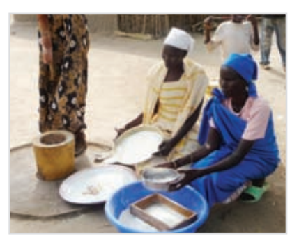
Women from the Covenant Church of Sudan are able to provide food for their families because of emergency relief.

Drought has gripped this region and other low-lying areas of East Africa for several years. The people are very thin and have no access to clean water. The leaders of the Covenant Church of Sudan (ECCS) have identified eight areas in South Sudan