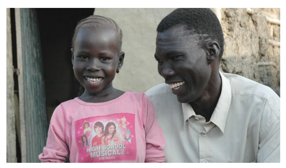
Vulnerable and orphaned children are cared for by their familes in South Sudan.

In order to keep these orphaned and vulnerable children out of institutions, the program works with widows and other relatives, empowering them through vocational training, micro-loans, and counseling. You can help keep these children in families by contributing to this project online or by check marked "South Sudan Vulnerable and Orphaned Children."