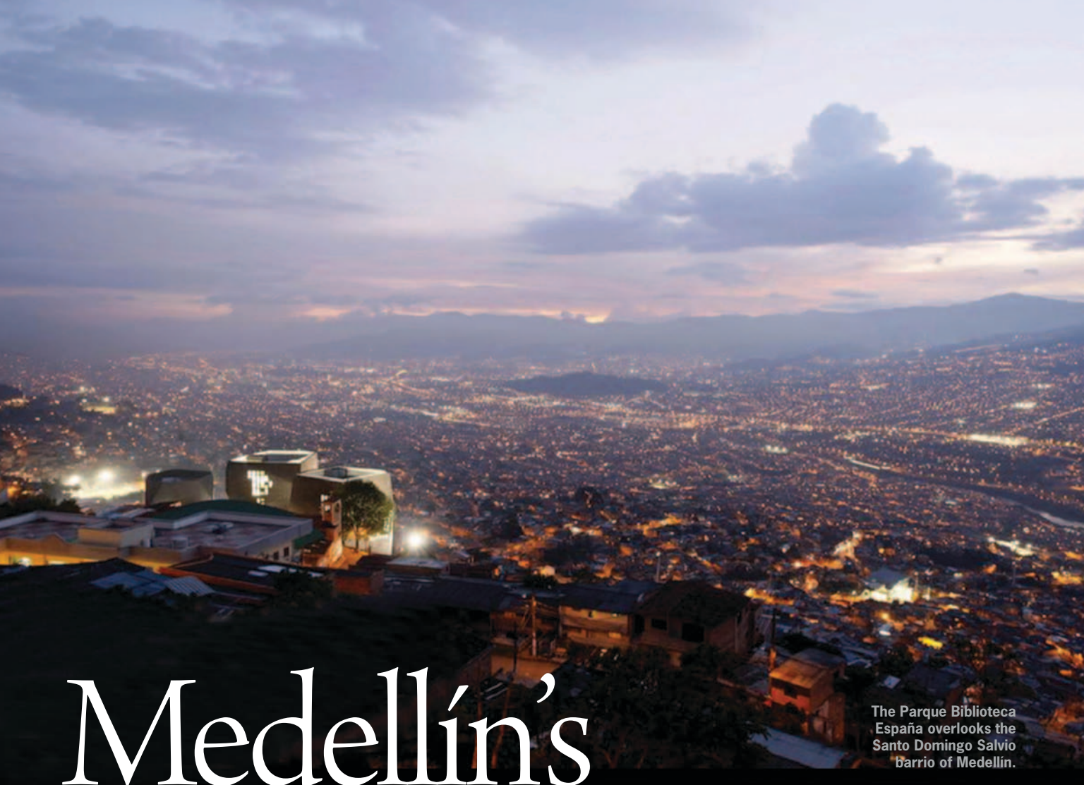
The Parque Biblioteca España overlooks the Santo Domingo Salvio barrio of Medellín.