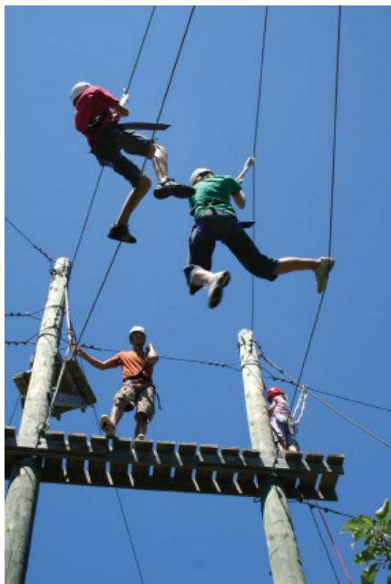
Portage Lake Camp, Michigan

the responsibility that God has given them and that in fact other kids follow them. They are a leader, not whether they call themselves a leader but because other people call them leader. And because of that, what is their responsibility before God to use their leadership, their influence, skills and abilities to use these for good rather than for ill?"