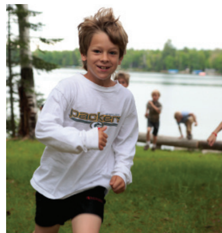
Covenant Point, Michigan