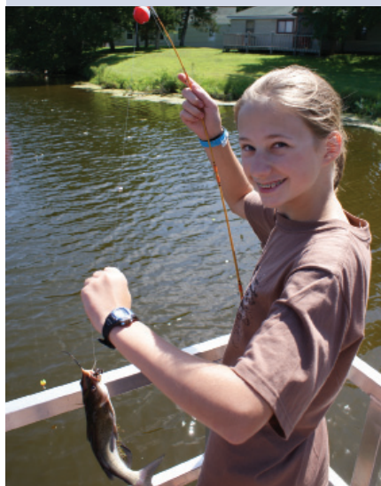
Covenant Cedars, Nebraska