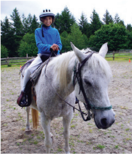
Cascades Camp, Washington

get a chance to try out living the way Scripture tells them to.