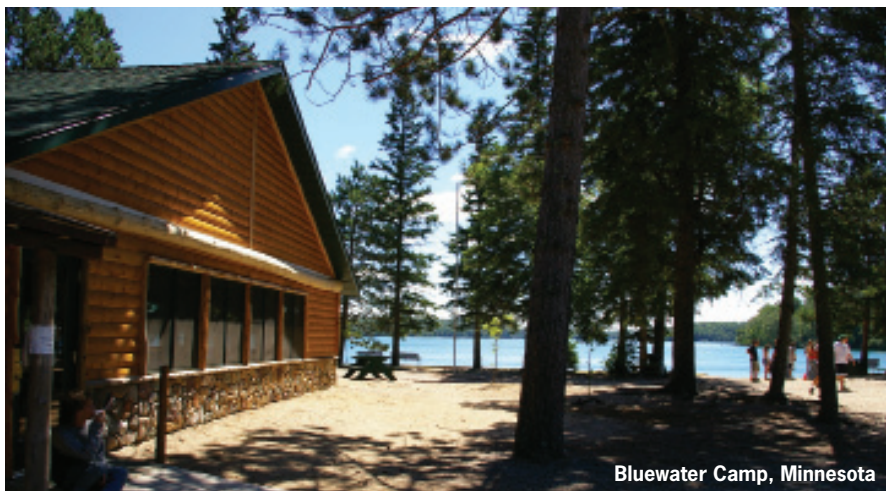
Bluewater Camp, Minnesota