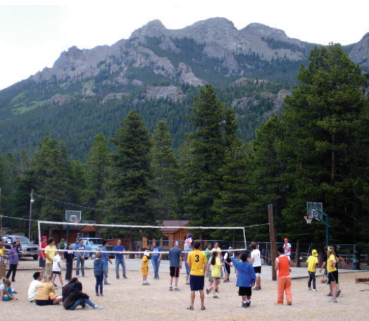
Covenant Heights, Colorado