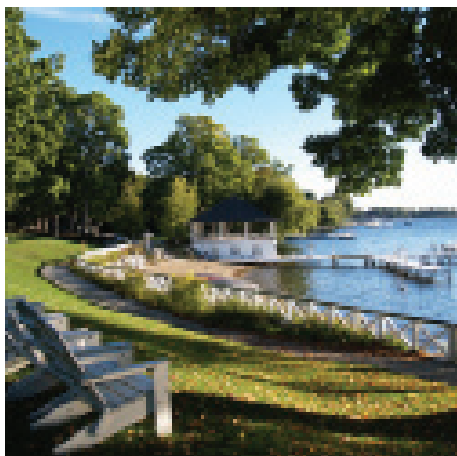
Covenant Harbor, Wisconsin