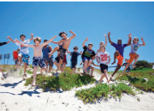
Mission Springs Camp, California

your shoulders, but next time we'll try this." She adds, "It gives them a little more ease and maybe then they'll take it to the next level."