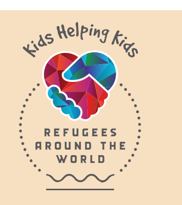
AVAILABLE FOR FREE 12-part Resource Encouraging Children to Serve God & Others CovChurch.org/kidshelpingkids

Would you like CWR to speak at your church? Contact us at cwr@covchurch.org