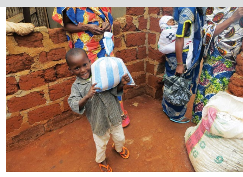
A child helps distribute food aid in the Central African Republic.

In the midst of these two major crises, CEFA and the ECCSS are committed to serving