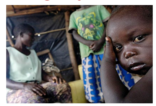
Partner with us in South Sudan.

South Sudan is the world's newest nation and has experienced incredible violence and conflict recently. At least 800,000 have been displaced and many have died. In this volatile situation, Covenant World Relief is providing emergency relief to refugees who have fled the country and to those who are internally displaced. CWR will be involved in a large scale, long-term response in South Sudan with the Evangelical Covenant Church of South Sudan and we need your