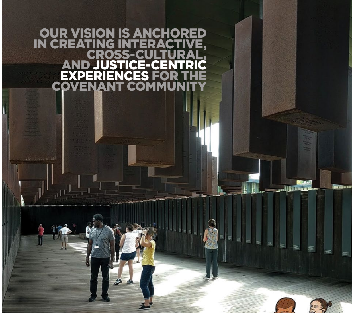
Sankofa participants visit the National Memorial for Peace and Justice, the first national memorial dedicated to acknowledging the victims of racial terror and the legacy of lynching in America.

OUR VISION IS ANCHORED IN CREATING INTERACTIVE, CROSS-CULTURAL, AND JUSTICE-CENTRIC EXPERIENCES FOR THE COVENANT COMMUNITY