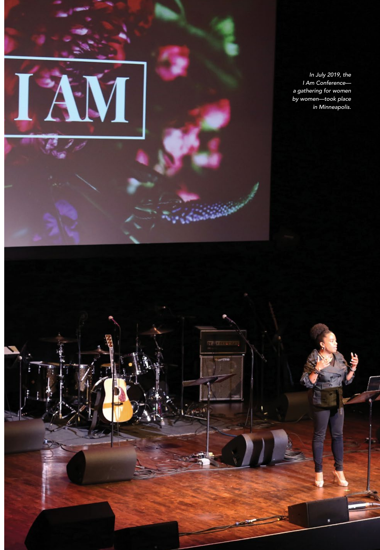
In July 2019, the I Am Conference—a gathering for women by women—took place in Minneapolis.

As members of the body of Christ, we seek to collaborate with the whole church to create an environment conducive for the development of kingdom efforts and impact.