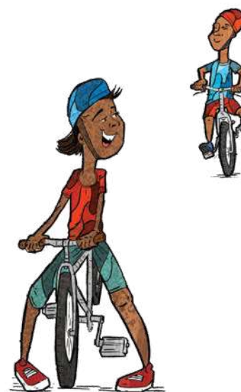
Justice Journey for Kids

Youth workers across the entire ECC have done an incredible job of caring for the younger generation of Covenanters during the Covid-19 pandemic. They have led the church in developing creative ways for youth to connect even during “shelter in place.”