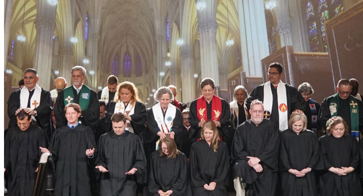
The cancellation of Gather 2020 meant the cancellation of the ordination service. We envision an ordination service in 2021 with nearly 100 ordinands as we combine the ordination classes of 2020 and 2021.

lives of ECC clergy. Our vision is to be present with our pastors to the best extent possible and be prepared to resource them with opportunities for personal leadership and spiritual growth.