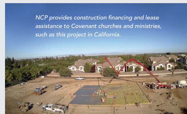
NCP provides construction financing and lease assistance to Covenant churches and ministries, such as this project in California.