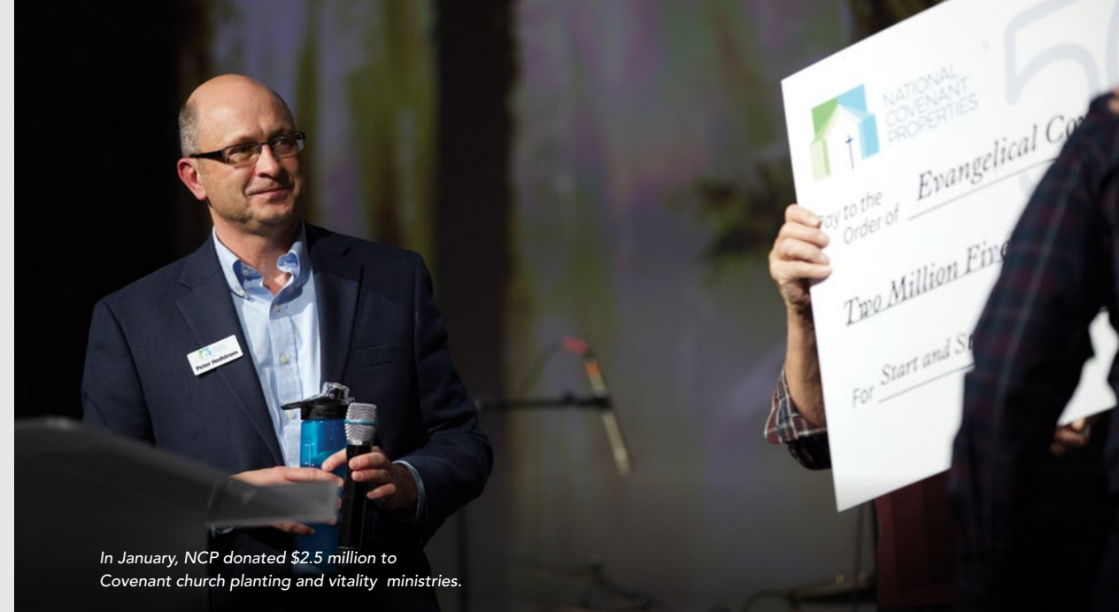
In January, NCP donated $2.5 million to Covenant church planting and vitality ministries.

The NCP staff helps churches and project leaders identify land and facility options, negotiate leases and real estate purchases, construct and expand current facilities, as well as sell and lease out current church properties.