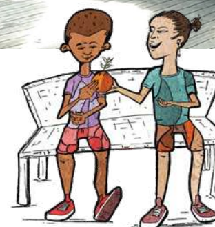
Justice Journey for Kids

For the first time ever, we had 40 Covenant pastors and credentialed leaders participate in Sankofa, one of our