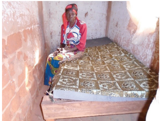
Photo left: A makeshift bed in the health center does not meet the standards created by the Ministry of Health.