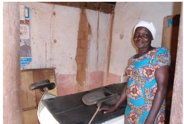
Photo left: A birthing bed at the health center before CVA was implemented.