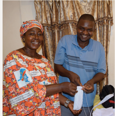
Participants learn to construct tampons during menstrual hygiene management training—a training made possible because of your support of Covenant Kids Congo powered by World Vision.

For example, during this reporting period, an assessment of 22 communities and two schools showed WASH facilities did not comply with required standards. In the schools, the ratio of students to each latrine far exceeded that of the World Health Organization standard—at least one toilet for every 25 girls, and one toilet and one urinal for every 50 boys. Also, in communities, while water points were nearby, and met the distance requirement of having clean water within a 30-minute round-trip walk from their homes, families were unable to obtain water due to charges by the local company responsible for water distribution. Families resorted to drawing water from rivers located 1,000 meters (.6 miles) away.