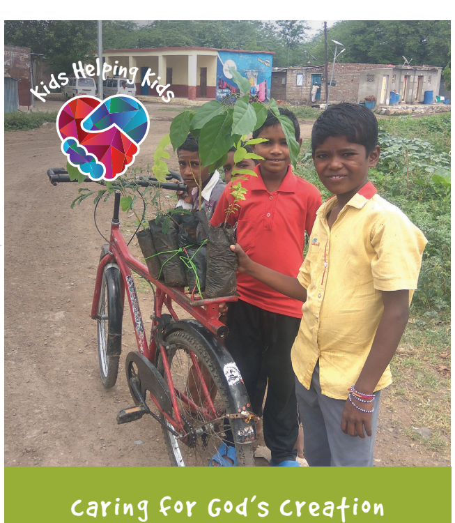
caring for God's creation