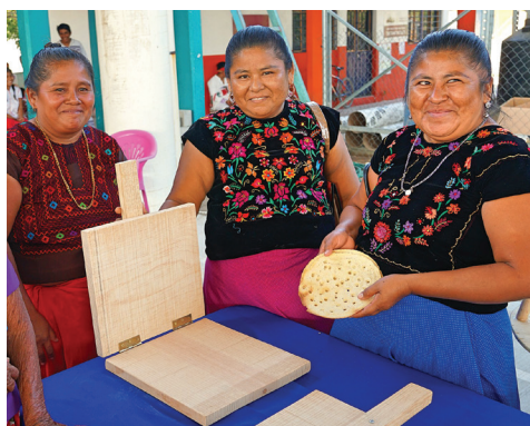
An improved press for making totopos

Fuentes Libres women's community savings groups. Using their God-given creativity and ingenuity, these women have designed household tools and other instruments to improve their livelihoods. They are currently seeking ways to market these more broadly. Fuentes Libres also started a CWR-funded