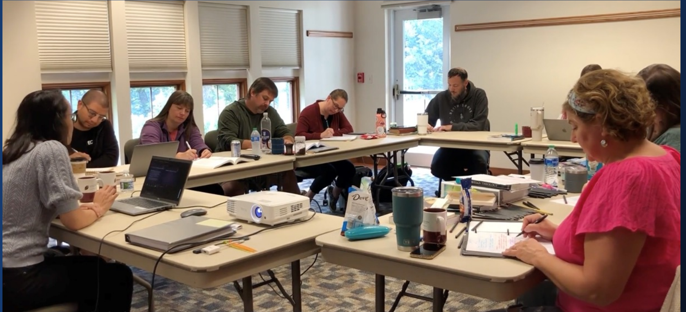
Ignite & Equip cohorts leading to development of all-Covenant cohort