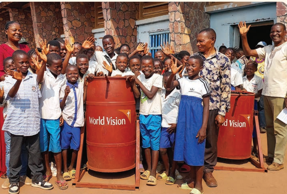
Percentage increase of households with access to a clean water source within 30 minutes (round trip) of home in Gemena

Will you join us in praying for WASH efforts in Gemena and Karawa in the coming year?