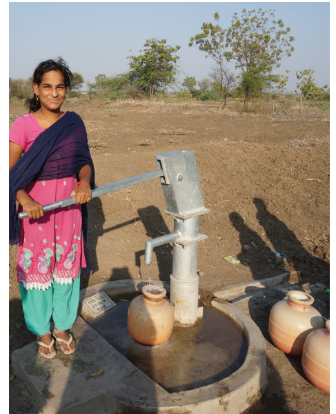
Learn more and give at CovChurch.org/projectblue .

Several HCC staff members are experts in the field of watershed management and are pursuing different solutions to the water problems in South Solapur. They supervise the construction of new wells and, with each water project, they are finding ways to be environmentally conscious by contouring the land in order to recharge wells through rainwater and prevent runoff. This ensures the growth of crops and the sustainability of drinking water sources. We are so grateful to all who continue to support CWR water partners who are transforming lives.