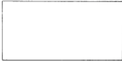
ILLUSTRATION OF CRAFT