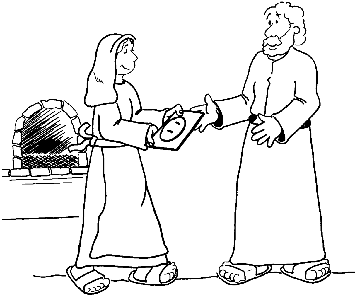
Illustration Elijah with the widow