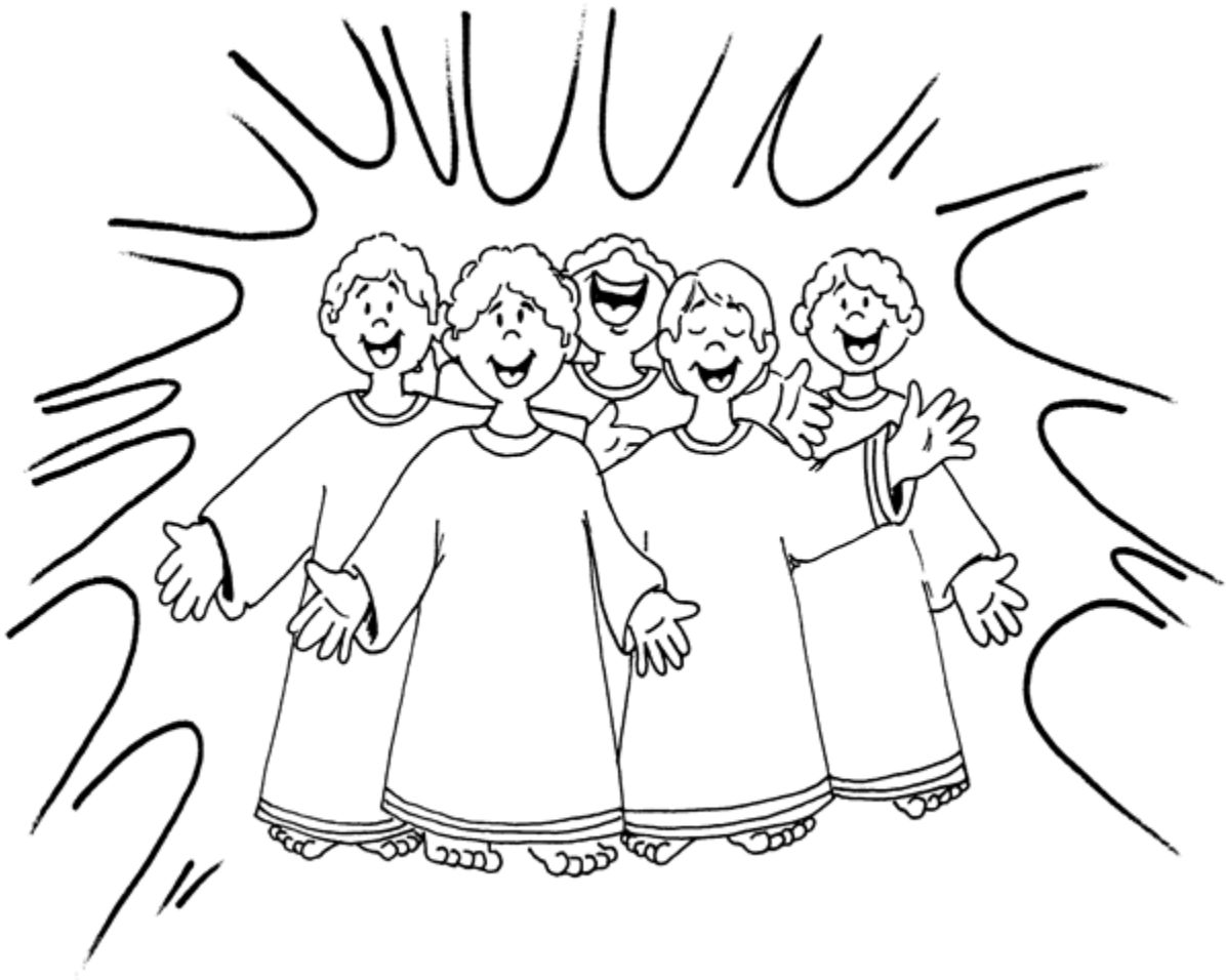
Illustration – Angels

Today in the town of David a Savior has been born to you; he is the Messiah, the Lord. (Luke 2:11)