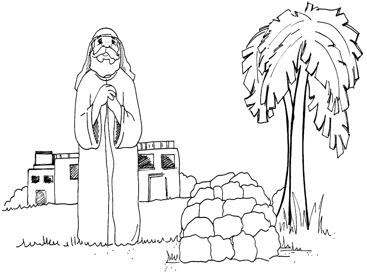
ILLUSTRATION ABRAHAM AT BETHEL