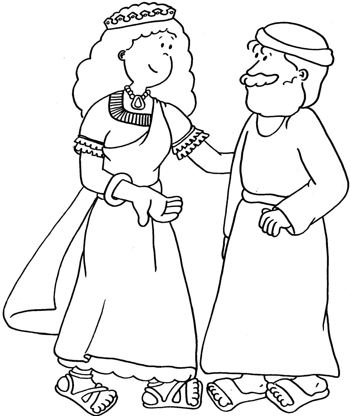
ILLUSTRATION ESTHER AND MORDECAI