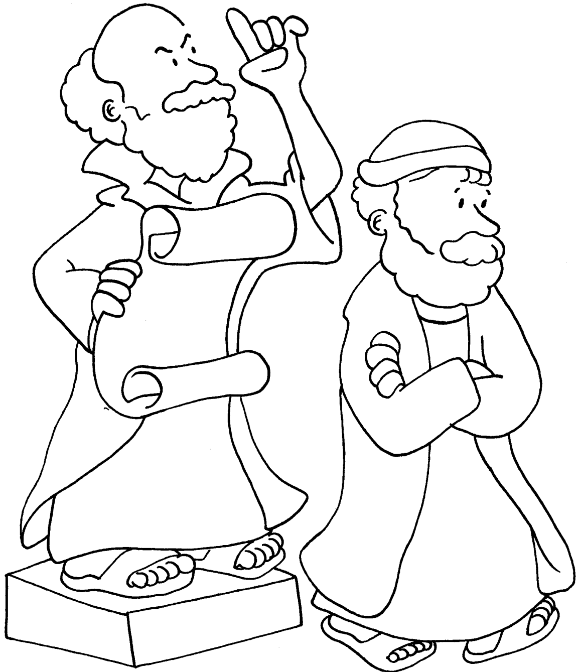
ILLUSTRATION MORDECAI AND HAMAN