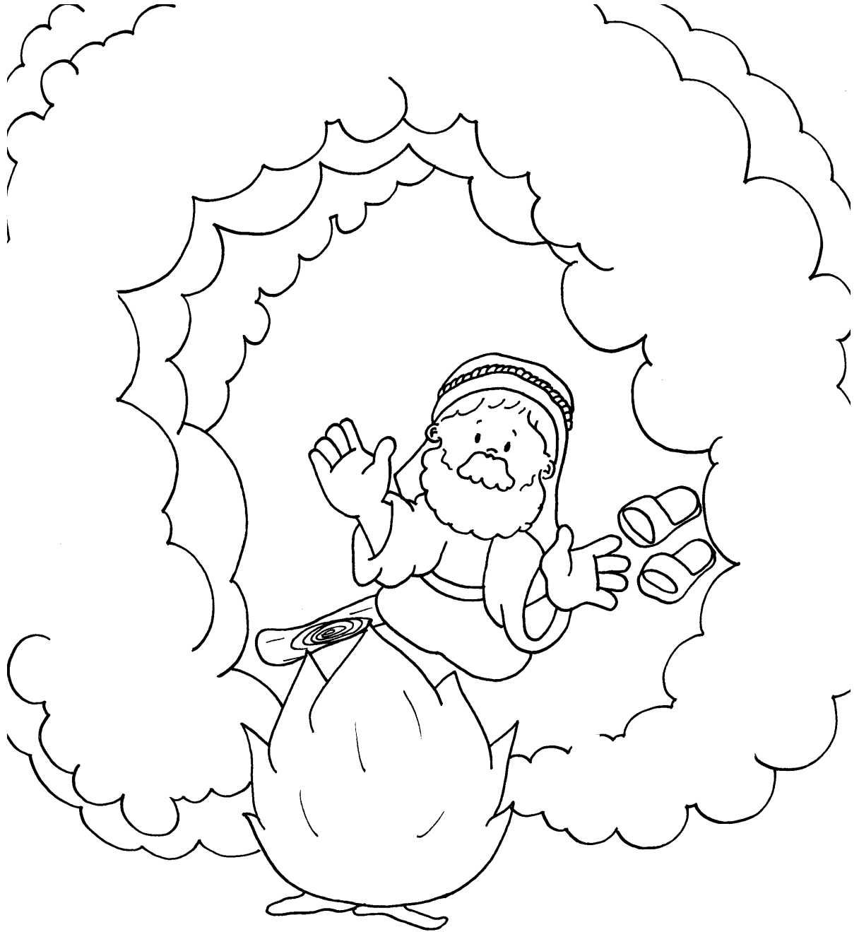
ILLUSTRATION GOD CALLS MOSES