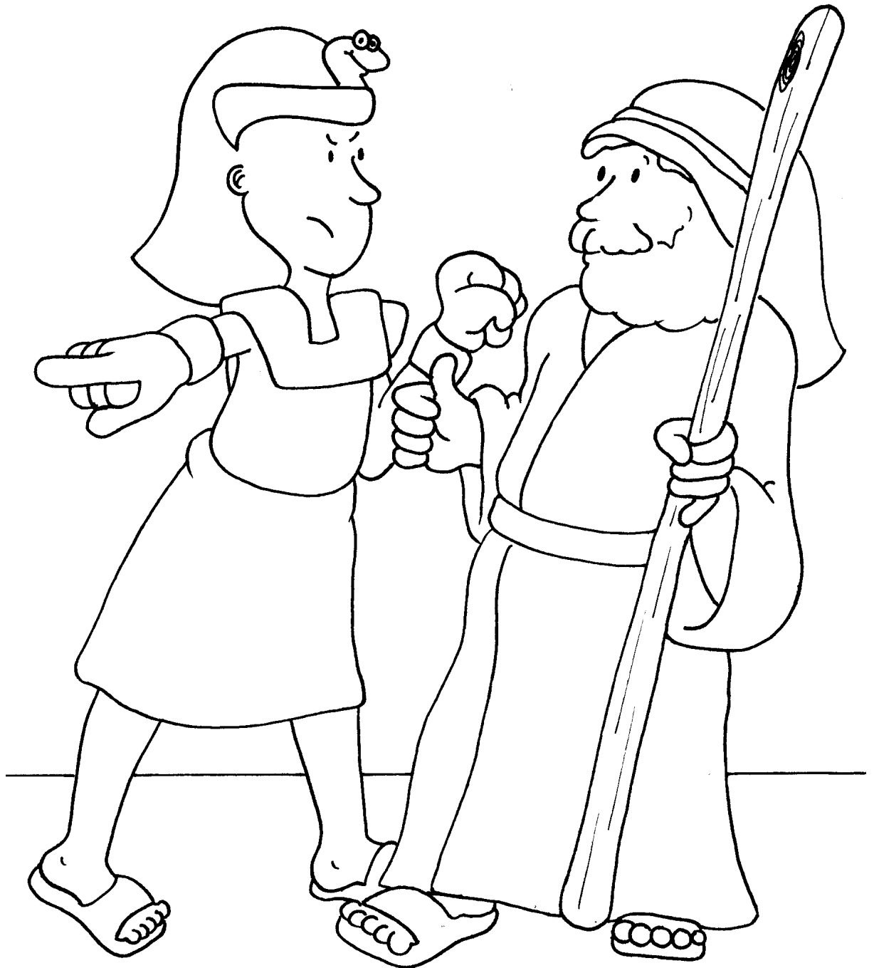
ILLUSTRATION MOSES WITH PHAROH