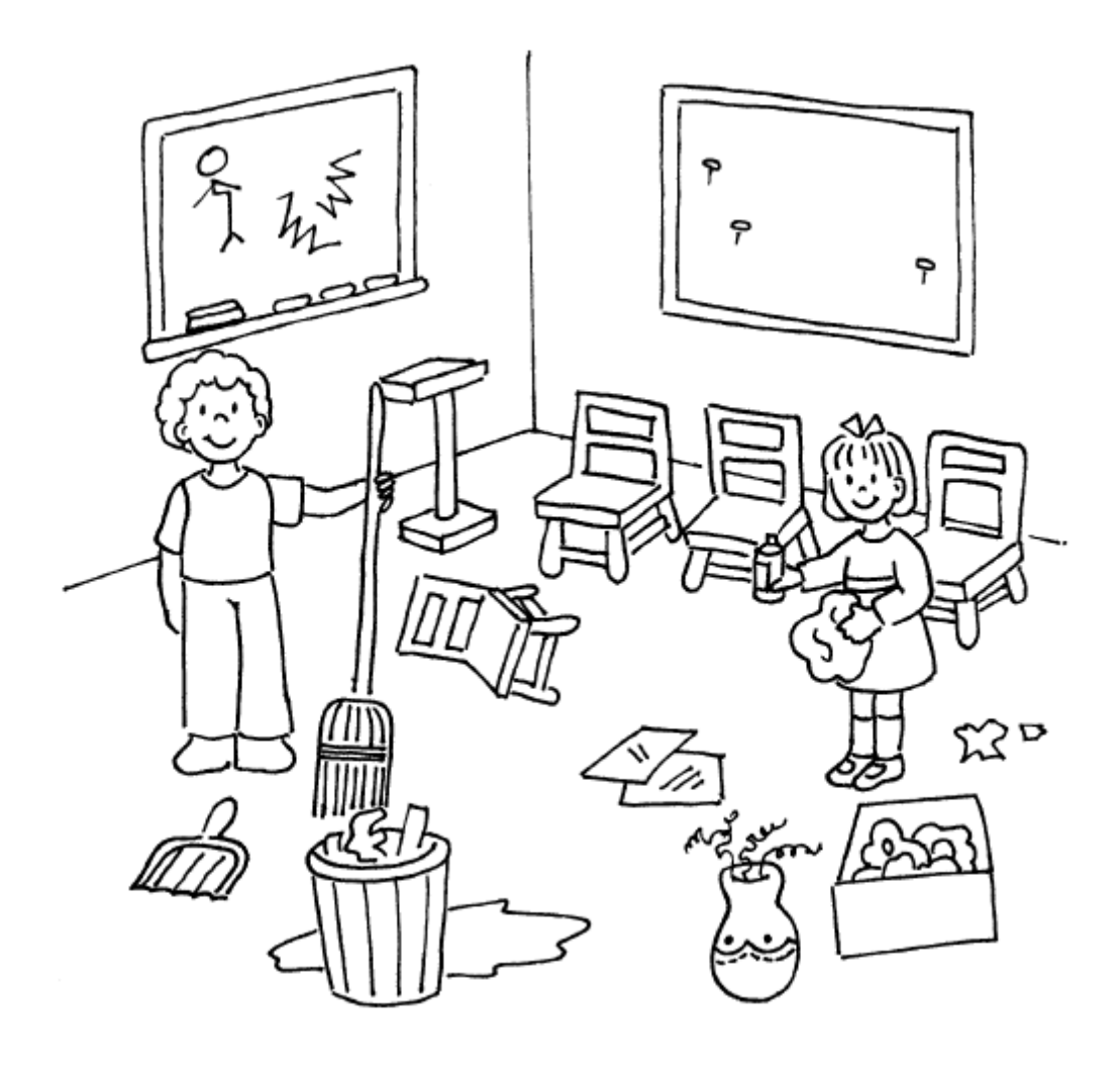
Train up a child in the way he should go, and when he is old he will not depart from it. Proverbs 22:6