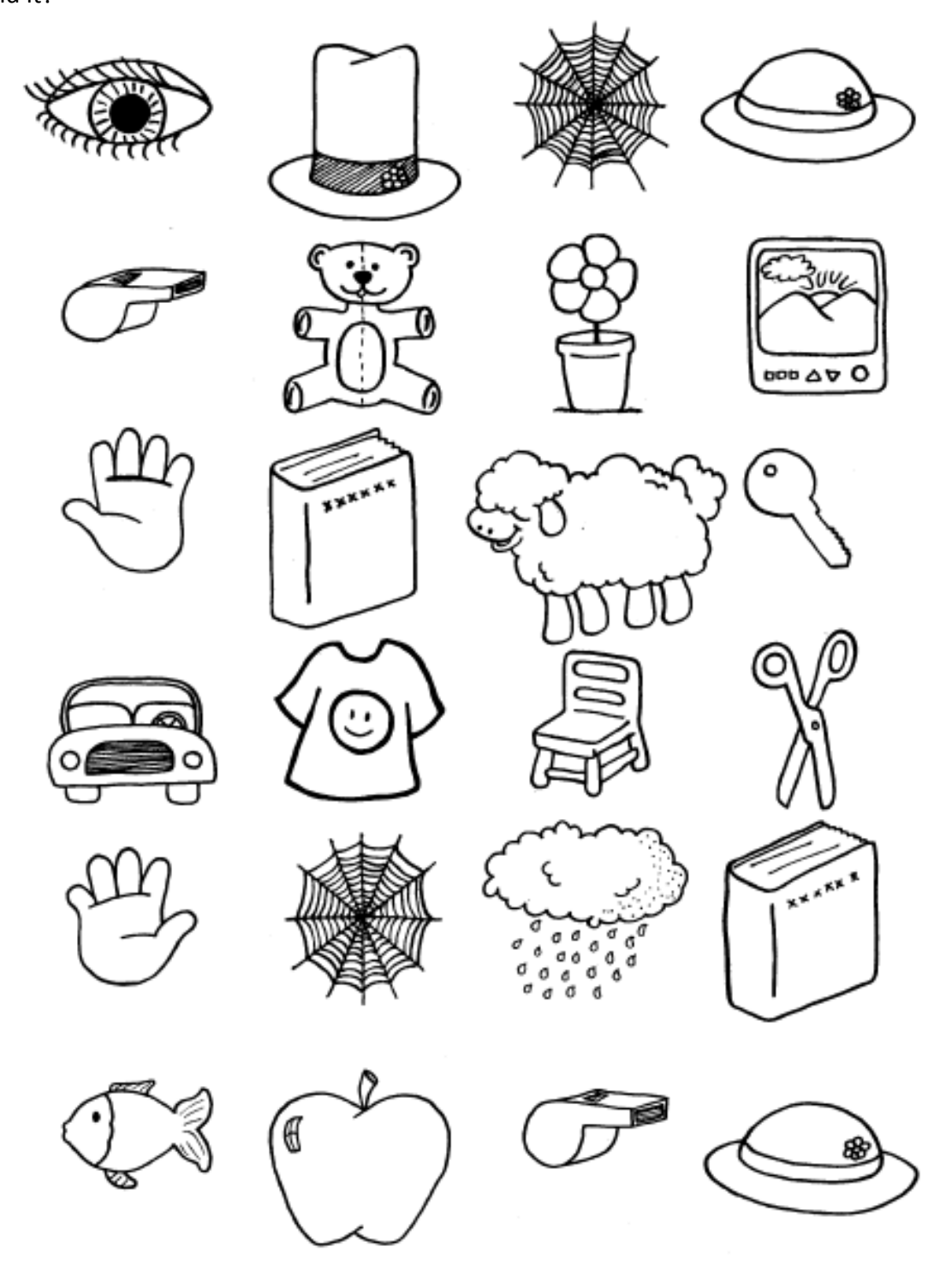
Illustration Who did it?