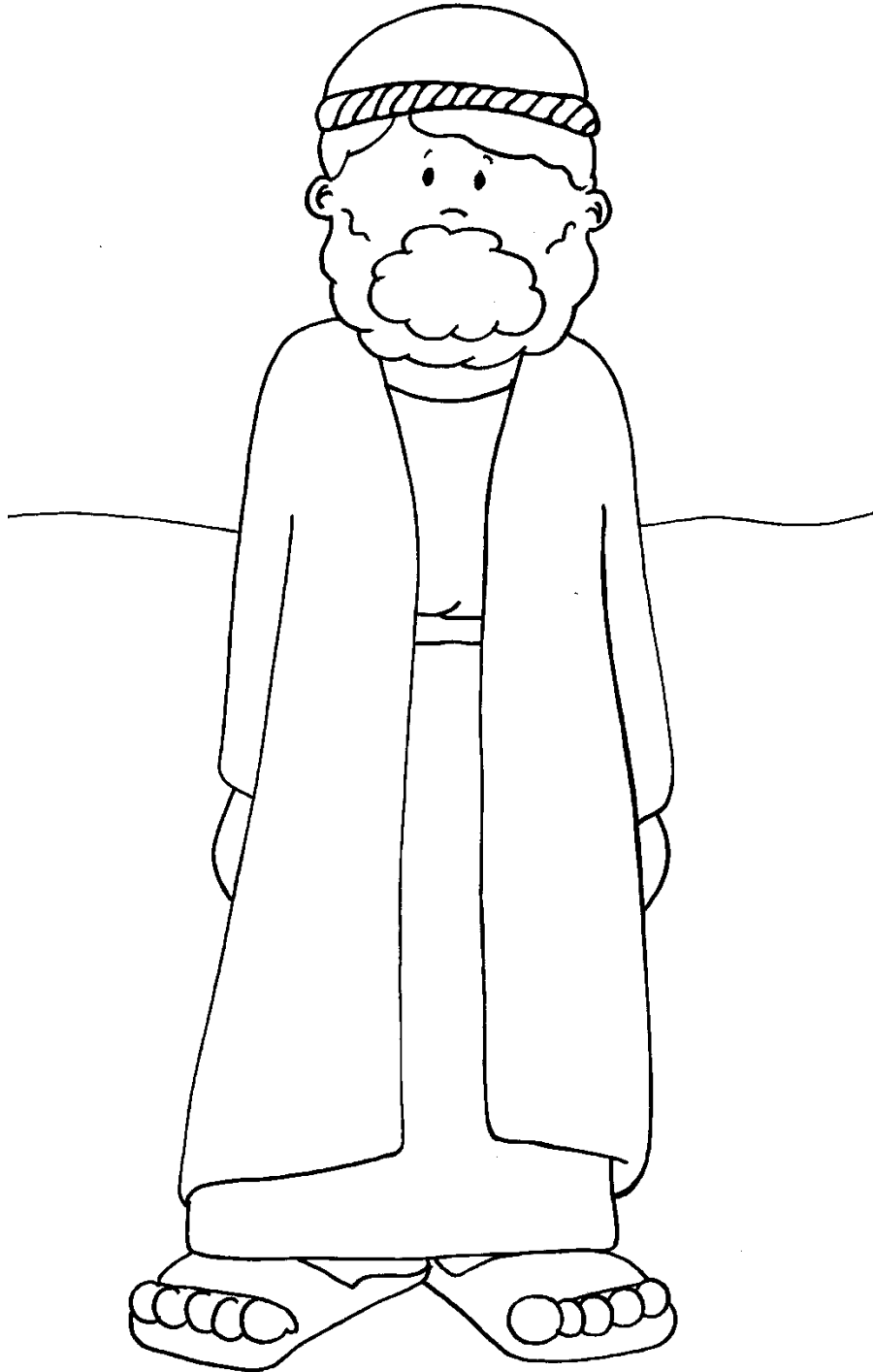
Illustration - Lot